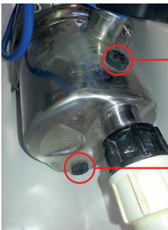
Remove This Screw

Remove small black screws x 2 situated on the top of the silver pump head and below the water in feed.