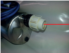
This is Bottom Feed In

1. Ensure there is a good flow of water from the bowser to the pump (in feed bottom out feed top)